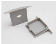
End cap with hole End cap without hole