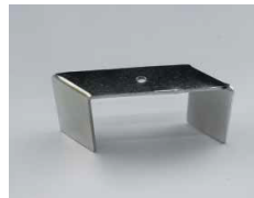
Metal mounting clip (MT)