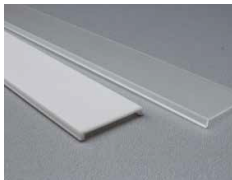
White lens (WH) Frost lens (FR)